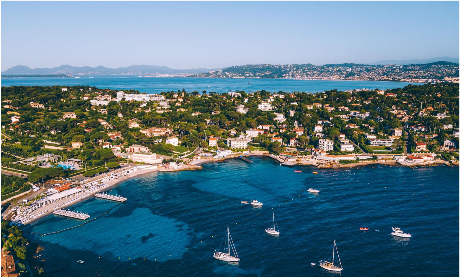
Baie of Antibes

https://www.afgc.asso.fr/evenement/fib-symposium-2025/