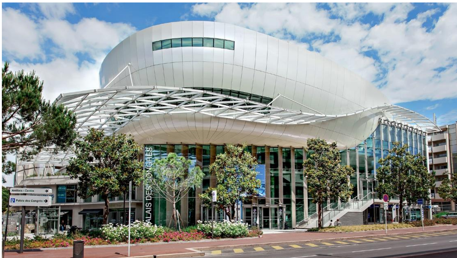
© Palais des Congrès Antibes-Juan Les Pins