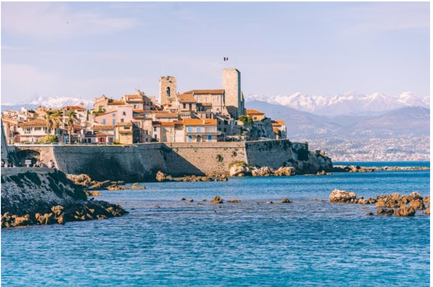
View of Antibes

We sincerely hope to see you in Antibes in June 2025!